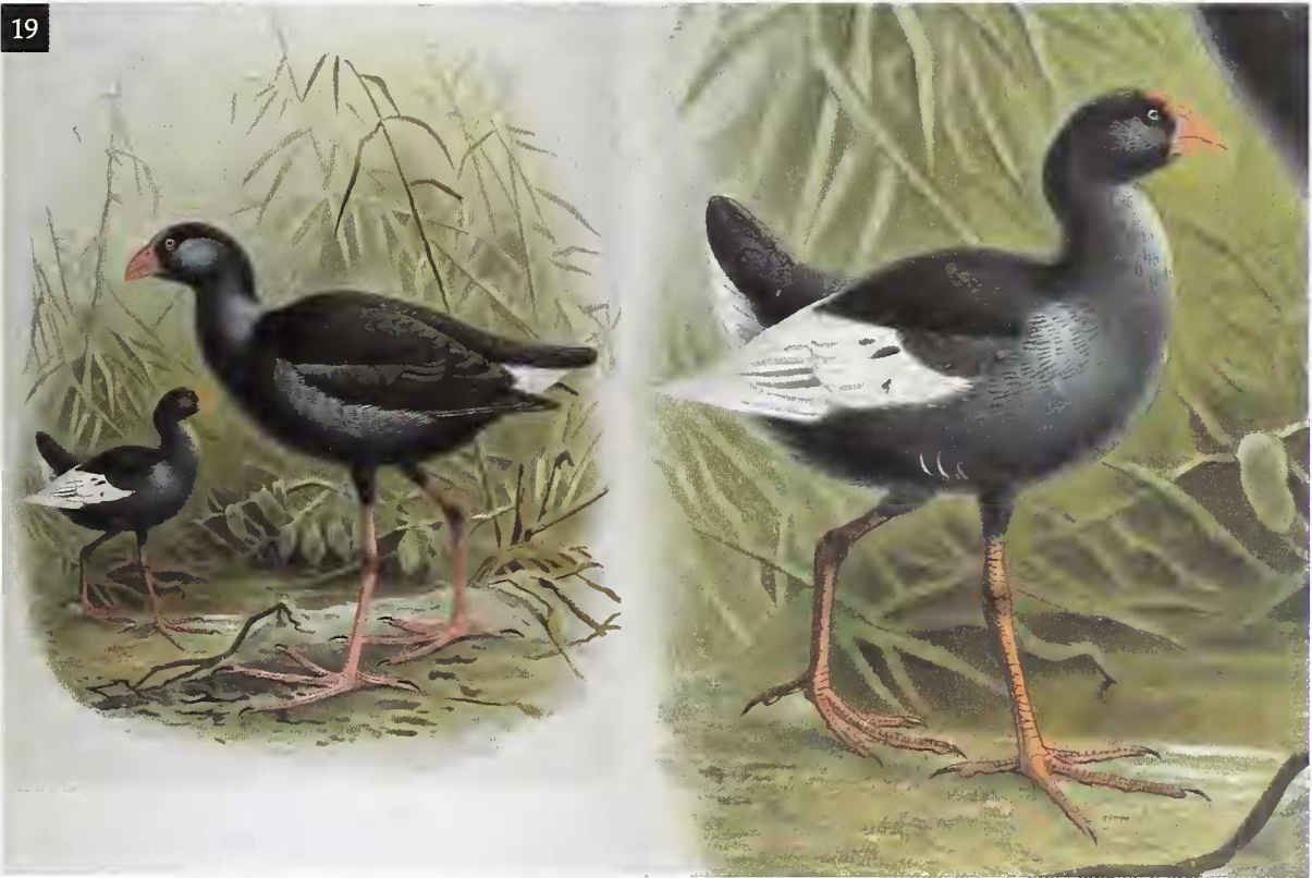
Figure 19. Pl. 31 in Buller (1888); full image (left) and inset (right) of New Zealand Swamphe P. p. melanotus with progressive greying based on a specimen in Buller's collection (Hein van Grouw, Natural History Museum, Tring)